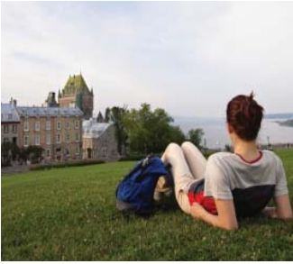
Quebec City, Canada