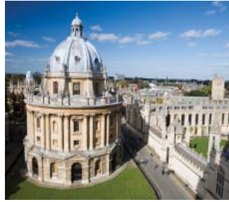
Oxford University, England